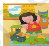
to practice sport