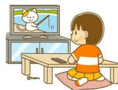
To watch TV