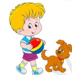
To walk with my dog