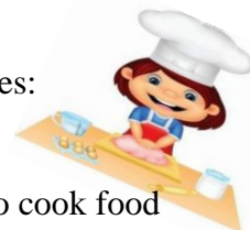
To cook food