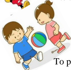
To play with friends

I write about my leisure time activities during the weekend. I use the following cues: