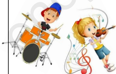
To play musical instruments