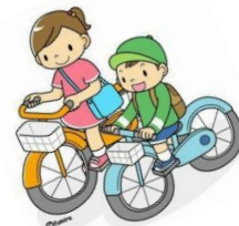
To ride with my friend