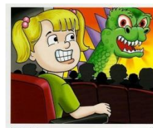
to go to the cinema