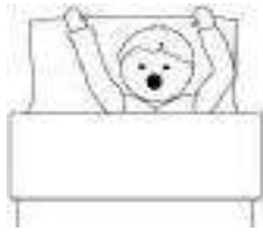
Amir gets up