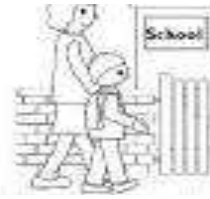
Amir goes to school