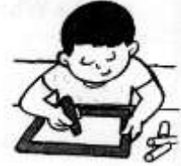
He does his homework

2-I read the text then I answer the following questions. (03pts)