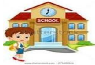
He ....goes to school.