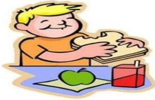
He .. has lunch.....